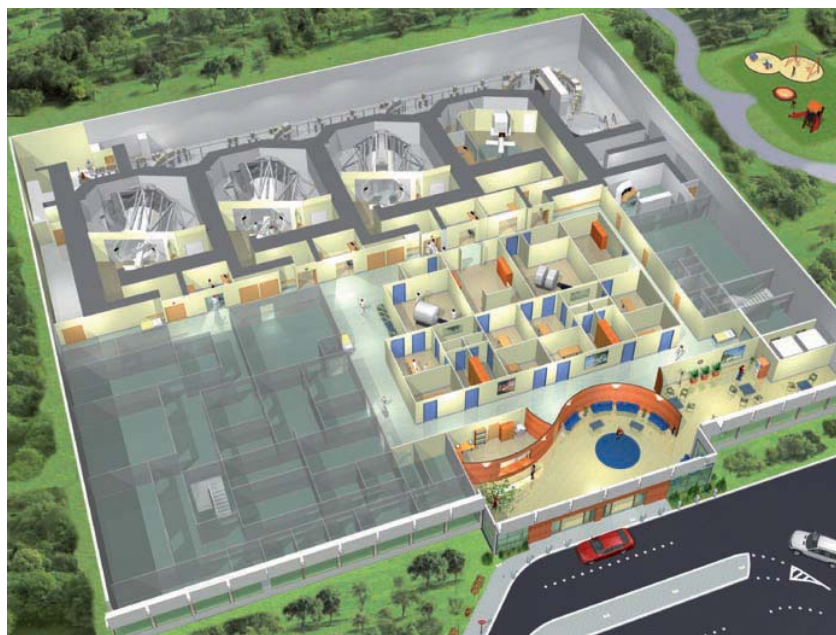
Layout of a hadrontherapy clinical facility

Research and collaboration between different European centres towards the creation of a prototype GRID test-bed for hadrontherapy and the promotion of common tools and strategies in Europe.