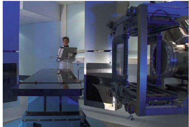
Hadrontherapy treatment room

Development and design of new accelerator-related technologies with affordable cost, reduced dimensions and optimal performance for clinical requirements.